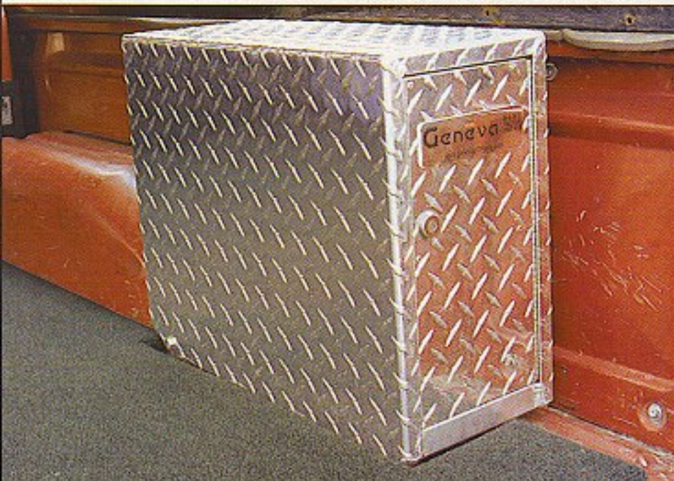
The sharp-looking, aluminum diamond-plate storage boxes not only look great, but also offer secure weather-tight storage.

Geneva Manufacturing builds secure storage boxes and storage compartments in numerous sizes for many different vehicle applications. These high-quality storage boxes come in either diamond-plate aluminum, black-powdercoated aluminum diamond plate, or steel. The steel surfaces are coated with iron phosphate, then powdercoated for rust resistance. The storage drawers come with either left- or right-opening doors, which makes mounting easy. The doors are secured with a unique cam-locking system to help secure tools and trail gear.