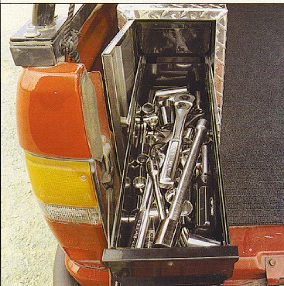
Each drawer offers ample storage for numerous types of tools. This drawer holds an entire 120-piece Craftsman tool set with room left over.